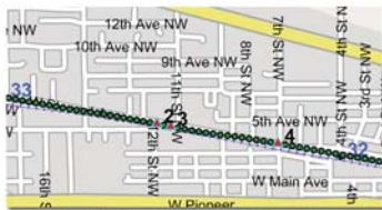
Real-Time GPS and Exception Plotting on GIS Shape Files