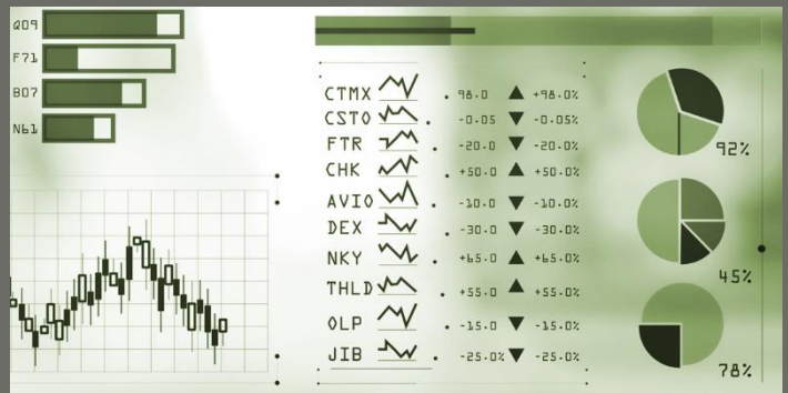
Actionable Reporting for Fleets - Track and Vehicle