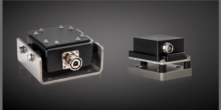
Tri-Axial Sensors for Acceleration and Orientation