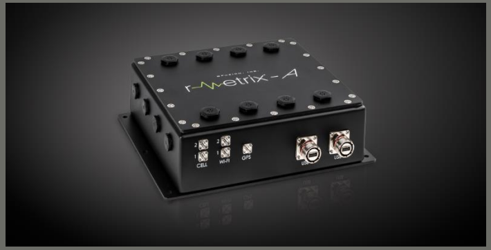
Solid State CPU with GPS, Wi-Fi, Ethernet, and Cellular